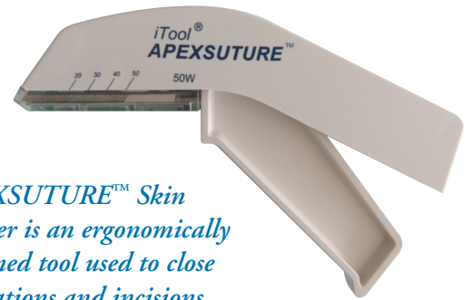
APEXSUTURE™ Skin Stapler is an ergonomically designed tool used to close lacerations and incisions similar to traditional needle sutures, reducing task time by 66 percent.