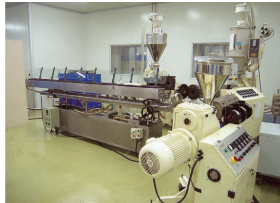
Cleanroom tubing extrusion capabilities