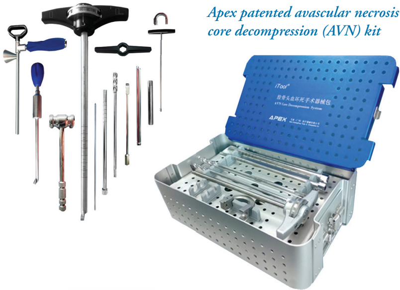
Apex patented avascular necrosis core decompression (AVN) kit

instruments including skin staplers, knee positioner, and bone mill for the North American, European and Asian Markets.