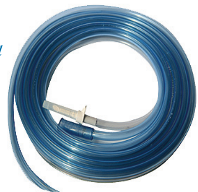
Apex flexible medical grade tubing