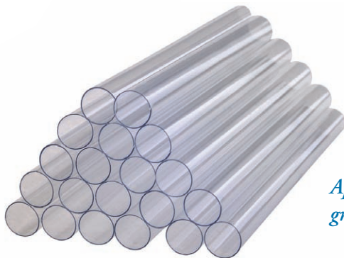
Apex rigid medical grade tubing