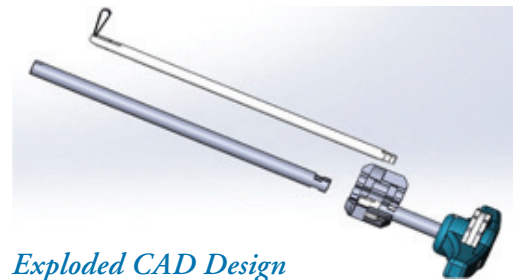
Exploded CAD Design