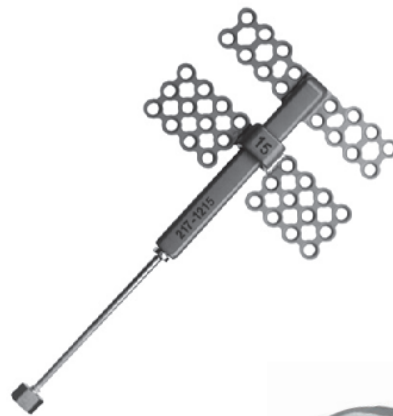
The Oracle Cranial Distractor allows the surgeon the ability to more easily generate new vascularized bone while performing a low risk procedure when compared to single stage treatment options.

An innovator in the development, design, manufacture and service of high quality and cost effective surgical products. The company specializes in the development of products for small bone reconstruction, distraction osteogenesis, spinal fusion and trauma surgical devices targeted primarily to the oral maxillofacial, neuro, spine, plastic reconstructive, otolaryngology (ENT), podiatry and small bone orthopedic surgical specialities.