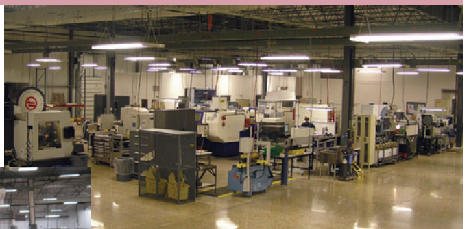
Production floor at Boyne City, Michigan facility