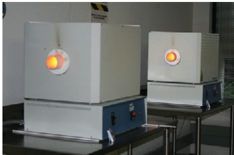
Furnaces used in production of biologic products