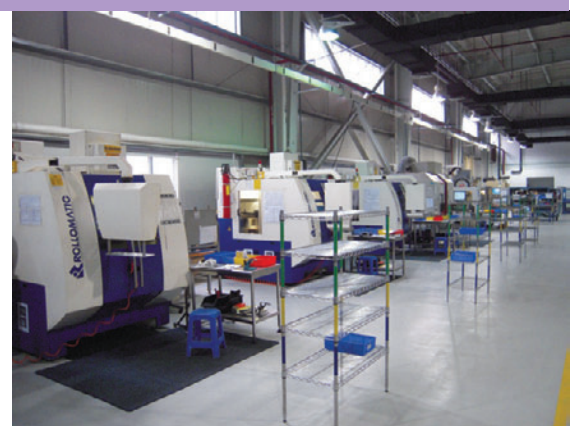
Shop floor grinders at the Apex facility