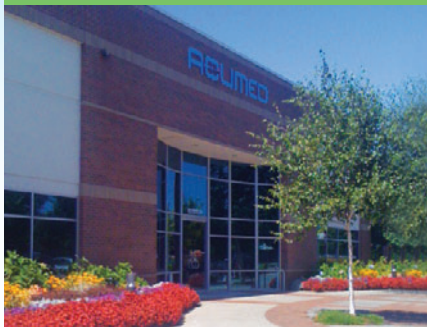
Acumed Headquarters Hillsboro, Oregon