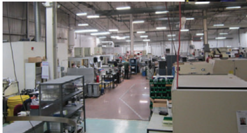
Production floor at Sault Ste. Marie facility