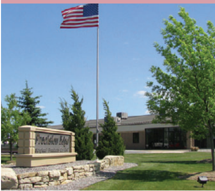
Precision Edge Surgical Products Headquarters Sault Ste. Marie, Michigan