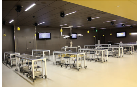
Acumed Learning Center used for surgeon bioskills training