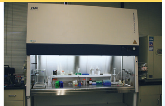
Tissue culture lab