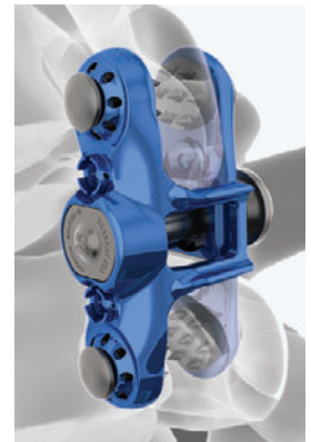
OsteoMed's primaLOK™ SP Interspinous Fusion System and primaLOK™ FF Facet Fixation System offers surgeons minimally disruptive and minimally invasive next-generation options.