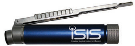
iSIS™ modular electric motor handpiece with hand throttle.