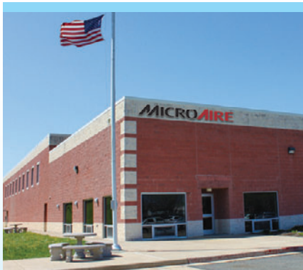
MicroAire Surgical Instruments Headquarters Charlottesville, Virginia