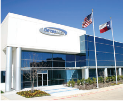
OsteoMed Headquarters Addison, Texas