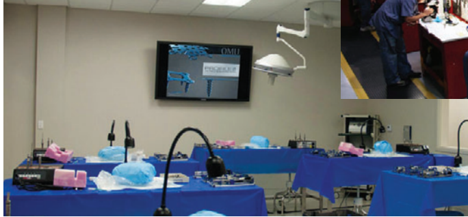
BioSkills Lab and training facility