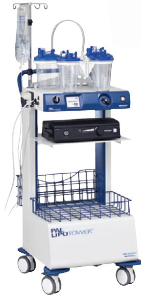
LipoTower™ sturdy and powerful surgical cart used for tumescent liposuction.

Designs, manufactures and markets powered surgical instruments for total joint replacement surgery, orthopedic surgery of the extremities, aesthetic and reconstructive surgery, endoscopic carpal tunnel release, and sterile orthopedic blades.