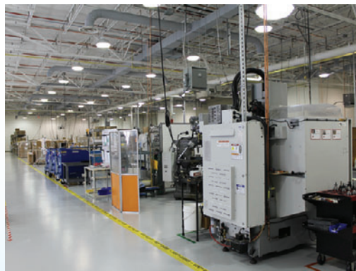
Manufacturing at MicroAire's new facility