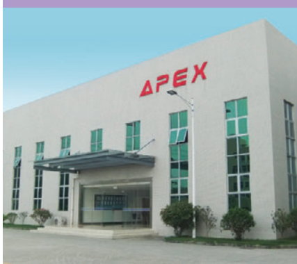
Apex (Guangzhou) Tools & Orthopedics Headquarters Guangzhou, China