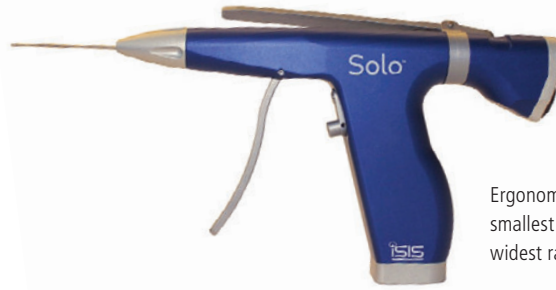
Ergonomic Solo™ Driver is the smallest wire/drill-driver with the widest range of wire sizes.